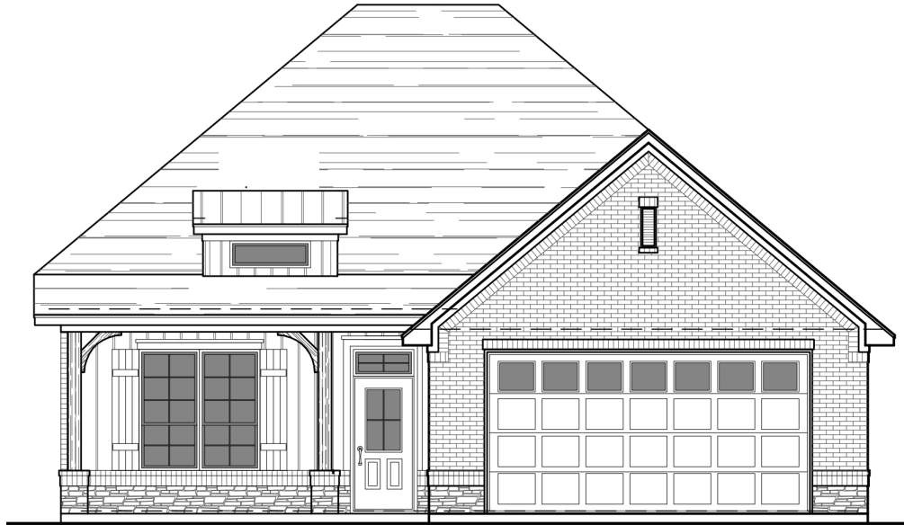
Elevation Option 1