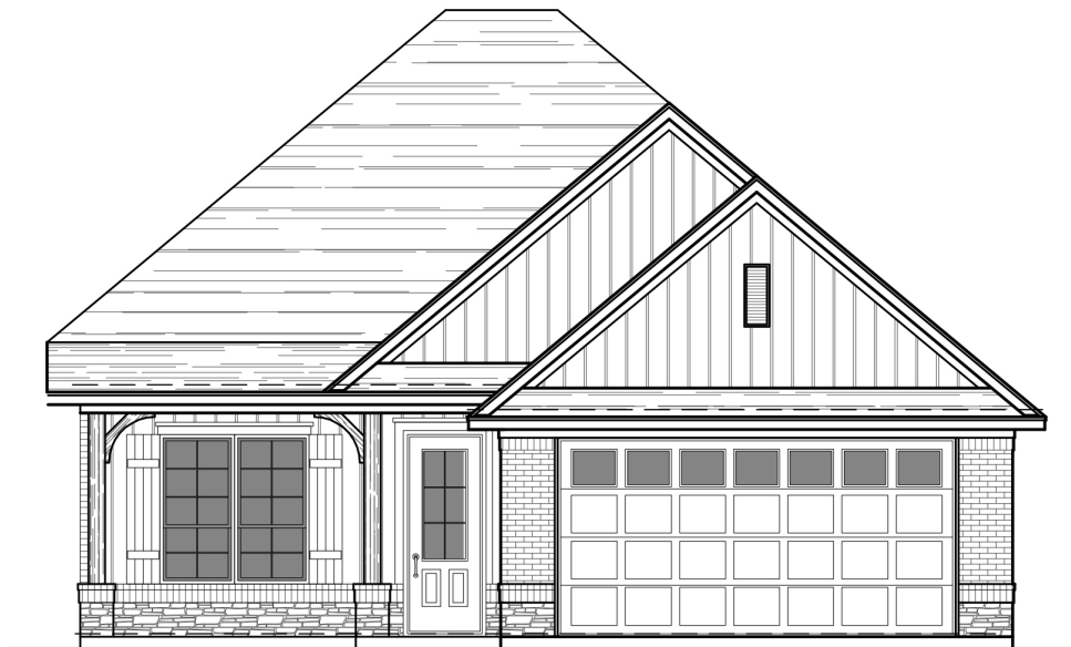
Elevation Option 2

The information included on this marketing material has been obtained from sources believed to be reliable, however, Preston Ridge Partners LLC (PRP) make no guarantee, warranty, or representation as to its completeness or accuracy thereof about its contents. Information is subject to error, omissions, change of conditions, prior to construction, or withdraw without notice. PRP reserves the right to modify methods or means at any time without notice. It is your responsibility to independently confirm its accuracy. Copyright (C), 2020 Preston Ridge Partners LLC. All Rights Reserved. Updated 05/18/20