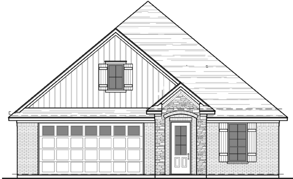
Elevation Option 1