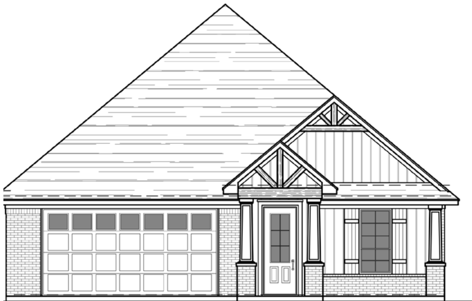
Elevation Option 2

The information included on this marketing material has been obtained from sources believed to be reliable, however, Preston Ridge Partners LLC (PRP) make no guarantee, warranty, or representation as to its completeness or accuracy thereof about its contents. Information is subject to error, omissions, change of conditions, prior to construction, or withdraw without notice. PRP reserves the right to modify methods or means at any time without notice. It is your responsibility to independently confirm its accuracy. Copyright (C), 2020 Preston Ridge Partners LLC. All Rights Reserved. Updated 03/07/23